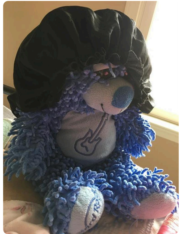
Blue Bear having a bad hair day!