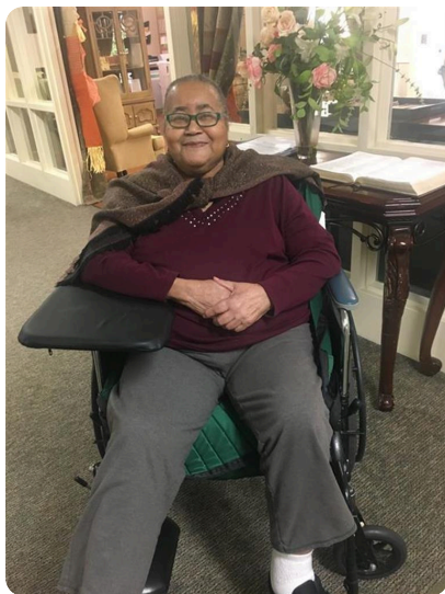
Having a nice day:)